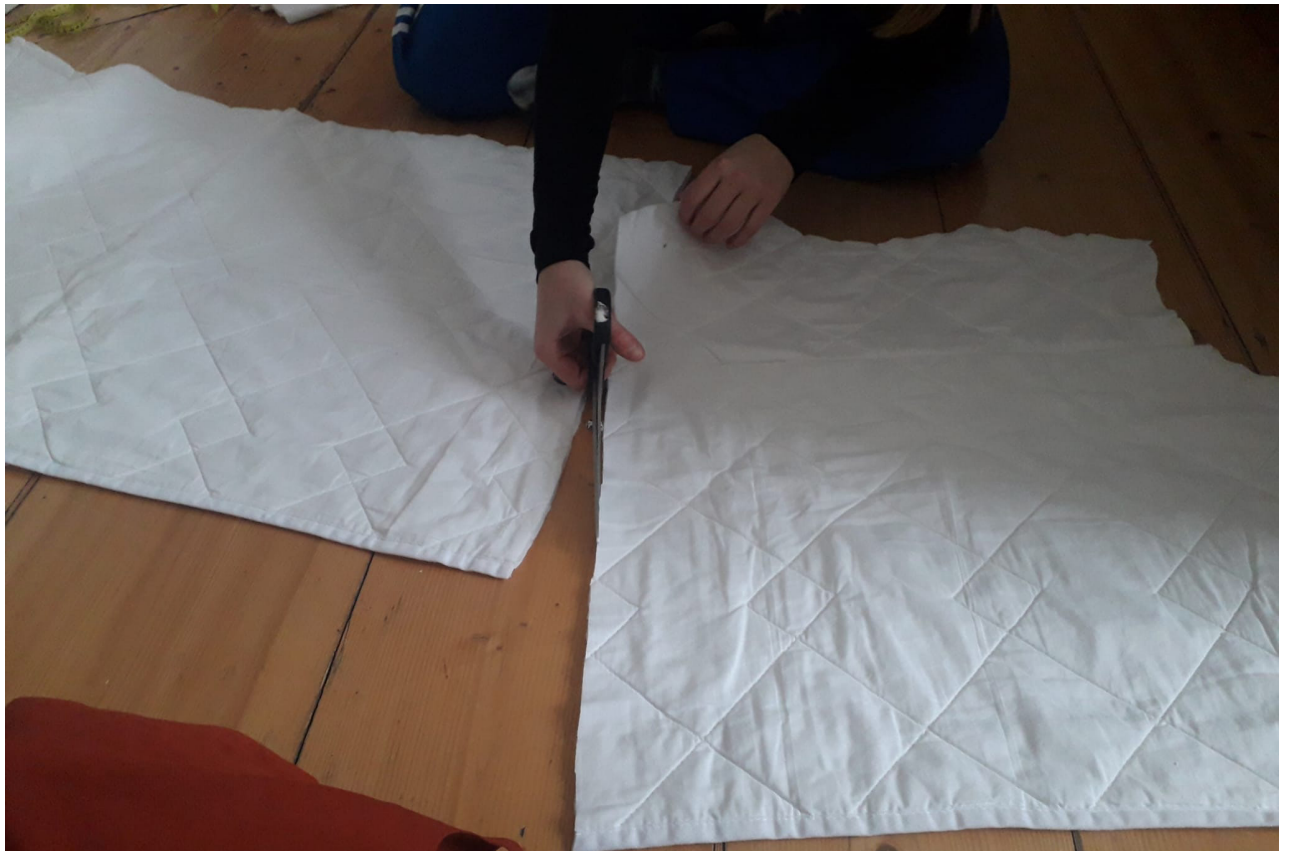
In The Making