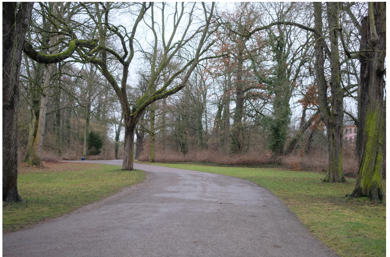
IImpark, Weimar Situation 01 - wide space