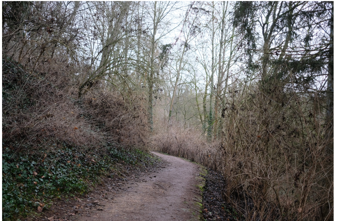
Ilmpark, Weimar Situation 02 - narrow space