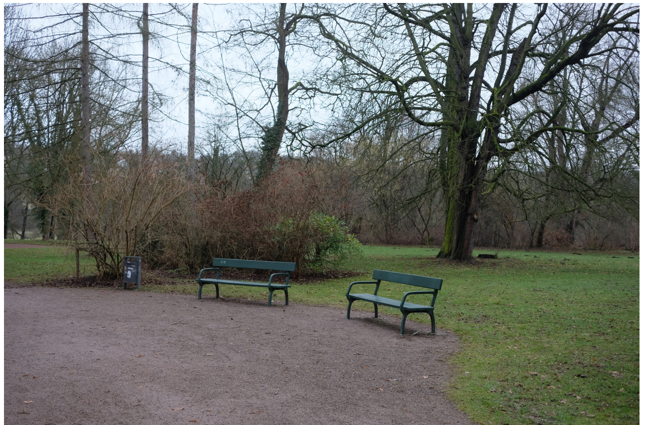
Ilmpark, Weimar Situation 03 - square