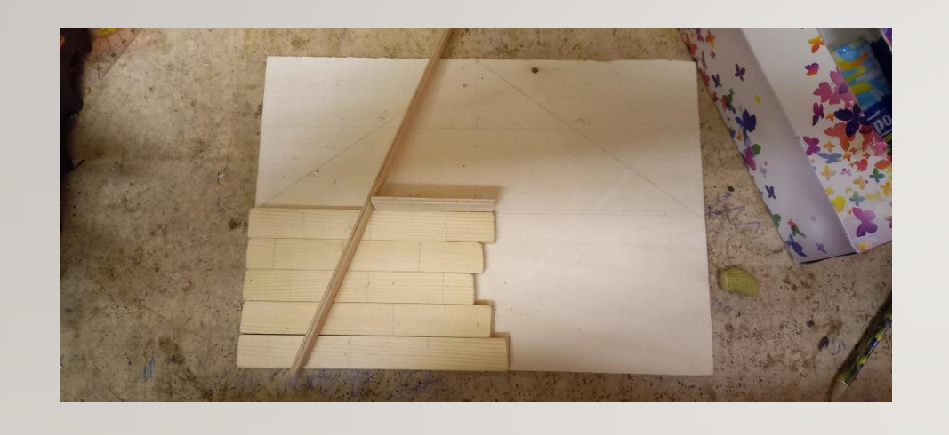
First steps of the front side and staircase