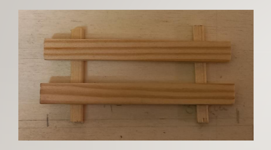
Left side of the house and fence