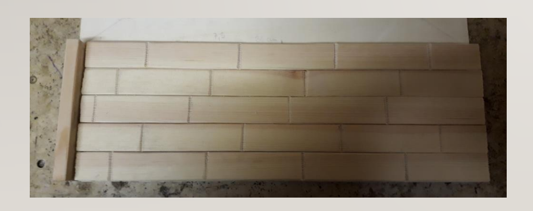
Backside and window