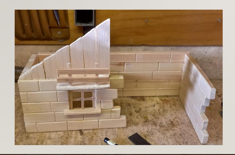
Roof part front side and final results