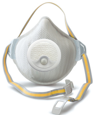
Air Filtration Mask