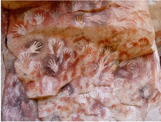
Cueva de las Manos, Perito Moreno, Argentina