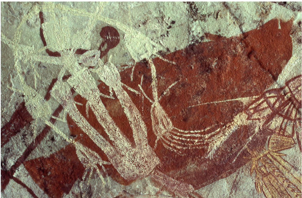
Painting at Jabiru Dreaming, Kakadu National Park