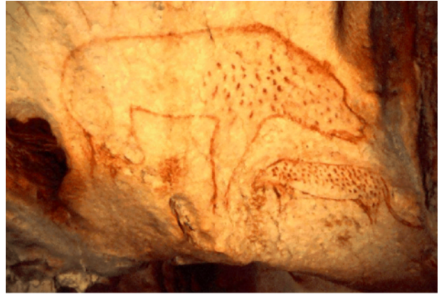
30,000-year-old cave hyena painting found in the Chauvet Cave, France