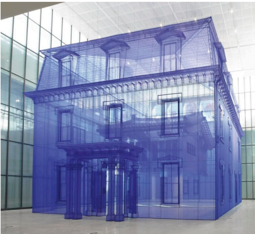
Home within Home, Do-ho Suh 2013 National Museum of Modern and Contemporary Art, Seoul

Do-ho Suh tried to visualize a space where the boundaries between the outside and the inside are unclear, freeing itself from the dichotomous clichés of Western and Oriental, individualism and collectivism. Through these "home" works that can be folded and moved like a suitcase, he captures the identity of modern people who require mobility and flexibility rather than settlement. Do-ho Suh's work dealt with Nomadism, the talk of our times. Memory is inherently untouchable. The choice of material as cloth was very effective in materializing or materializing non-material memories. The artist saw that the non-determination,