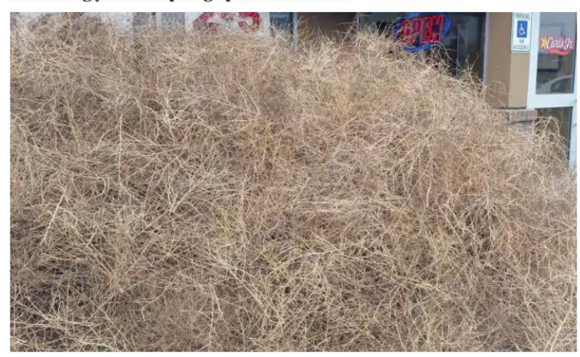
▲ One person was trapped for two hours until work crews could remove the tumbleweed.

Heavy winds sent thousands of tumbleweeds into Victorville, blanketing yards and piling up outside homes