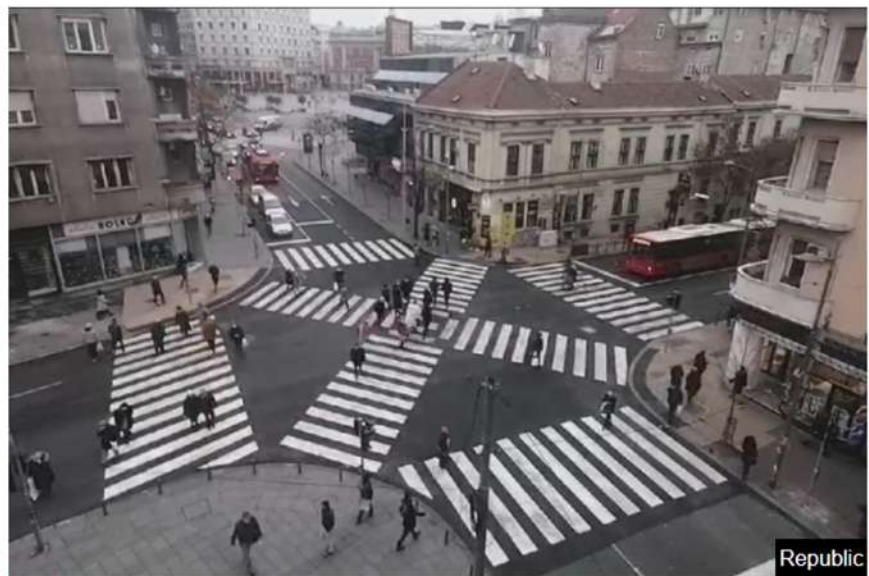
Pedestrian crossing near the Youth Center

The pedestrian crossing near the Youth Center, a traffic novelty that was recently introduced in the capital of Serbia, is still one of the burning topics in the capital.