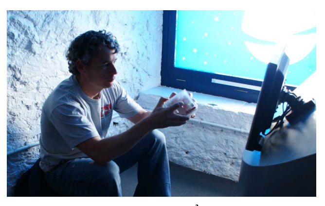
Figure 1. Perceiving data through H<sup>3</sup> while reading screen based information about hydrogen in deep space.

Another key characteristic of our research is the type of audience we are addressing. Infovis, a distinct field of research since the nineties, has traditionally focused on providing expert users with complex visual tools to assist with analytical tasks. More recent Infovis subfields, such as Am-