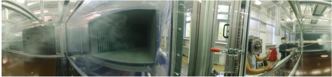
Monoscopic Panoramic view from inside the wind tunnel

PARFORCE: Partnership for virtual laboratories in civil engineering