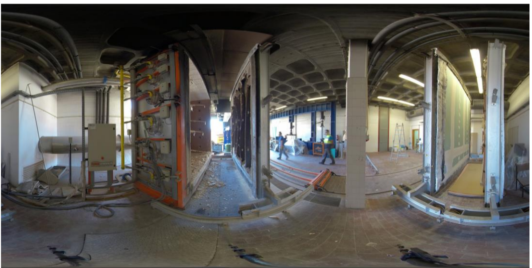
Stereoscopic Panoramic view of the fire resistance lab