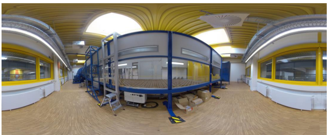
Monoscopic Panoramic view of the wind tunnel hall

COME TAKE A DIVE INTO VIRTUAL LABORATORIES: