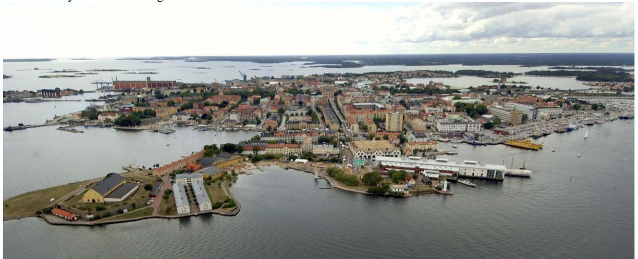
Aerial image of Stumholmen against a background of Trossö.

2009 marks at least three 20 year anniversaries - the fall of the Berlin Wall, leading to a "New Europe" with new possibilities for co-operation with other nations, cities and universities, the establishment of the Blekinge Institute of Technology (BTH), and the start of the programme of spatial planning at BTH, now also called "the Swedish School of Planning". We would like to celebrate these anniversaries by inviting you, our partner universities, to Karlskrona for a student workshop on the subject of "Heritage and Diversity" from the 4th to the 8th of May 2009. This will later be followed by a major Pax Baltica conference and other commemoration activities in Karlskrona on the anniversary of the fall of the Iron curtain. Among the plans by BTH is a seminar in October "Planning for sustainability in the Baltic region".