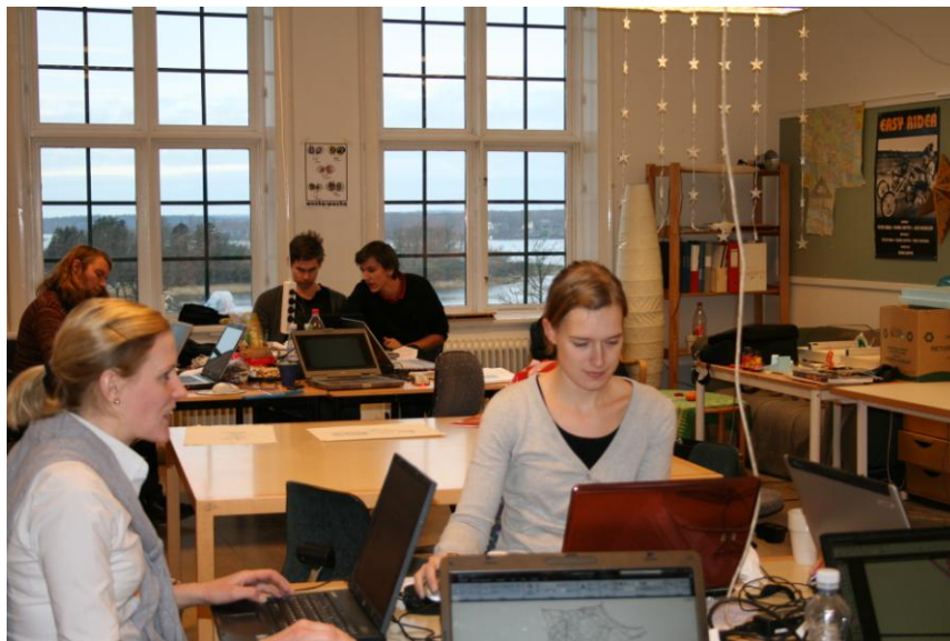
The premises of BTH are spacious and offer a view of the Baltic sea. Image Ulla Haglund Dec 2009

Lunches are offered at campus during the three days as part of the workshop, essential to get the groups going and staying together. Also participating scholars are invited. Final party organised by BTH students.