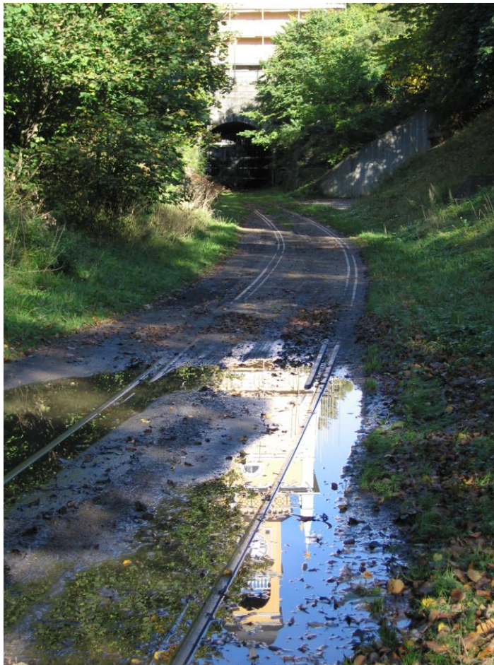
The glory of the past reflected in present decay.

Blekinge Tekniska Högskola SE-371 79 Karlskrona http://www.planeringsarkitekt.se/ http://www.bth.se/ifp